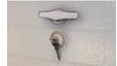
Outside keyed lock