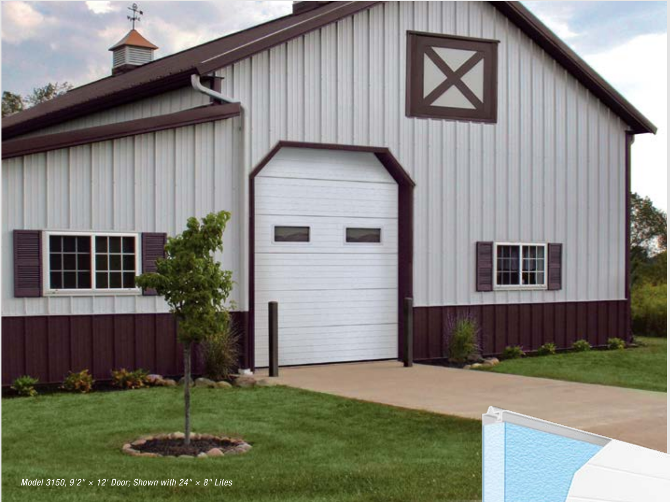
Model 3150, 9'2" x 12' Door; Shown with 24" x 8" Lites