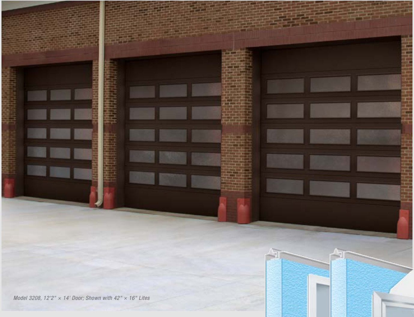
Model 3208, 12'2" x 14' Door; Shown with 42" x 16" Lites