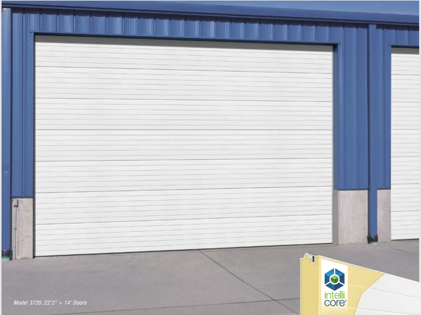
Model 3720, 22'2" x 14' Doors