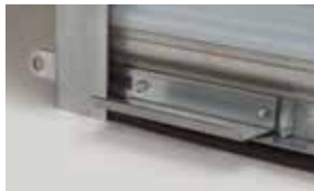
SLIDE BOLT LOCK