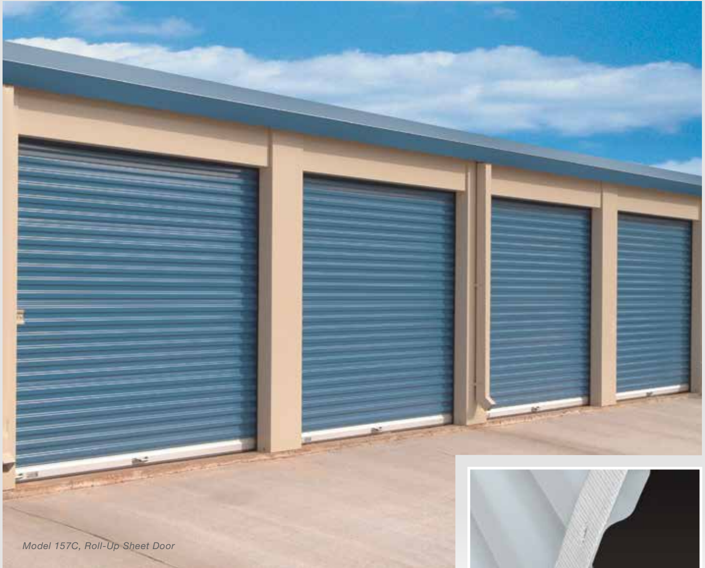
Model 157C, Roll-Up Sheet Door