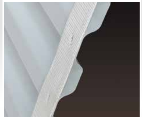
Corrugated Panel Design (Model 157C Shown)