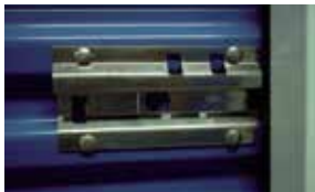
LOCK MINI LATCH

Maximum Height – 14' (150C, 157C), 18' (160C).