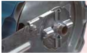
RATCHET SPRING TENSION ASSEMBLY